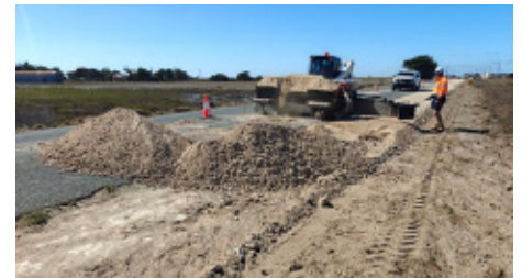
Above: Shoulder rehabilitation works, Narrung Road

Shoulder cement stabilisation began in late March and is expected to finish in early April 2026, followed by spray sealing works across the same section.