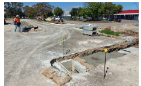
Above: New stormwater pit construction works at Railway Terrace Carpark, Tailem Bend.

Surface preparation is expected to start in early to mid-April 2026, with the existing pavement reused as part of the carpark rebuild