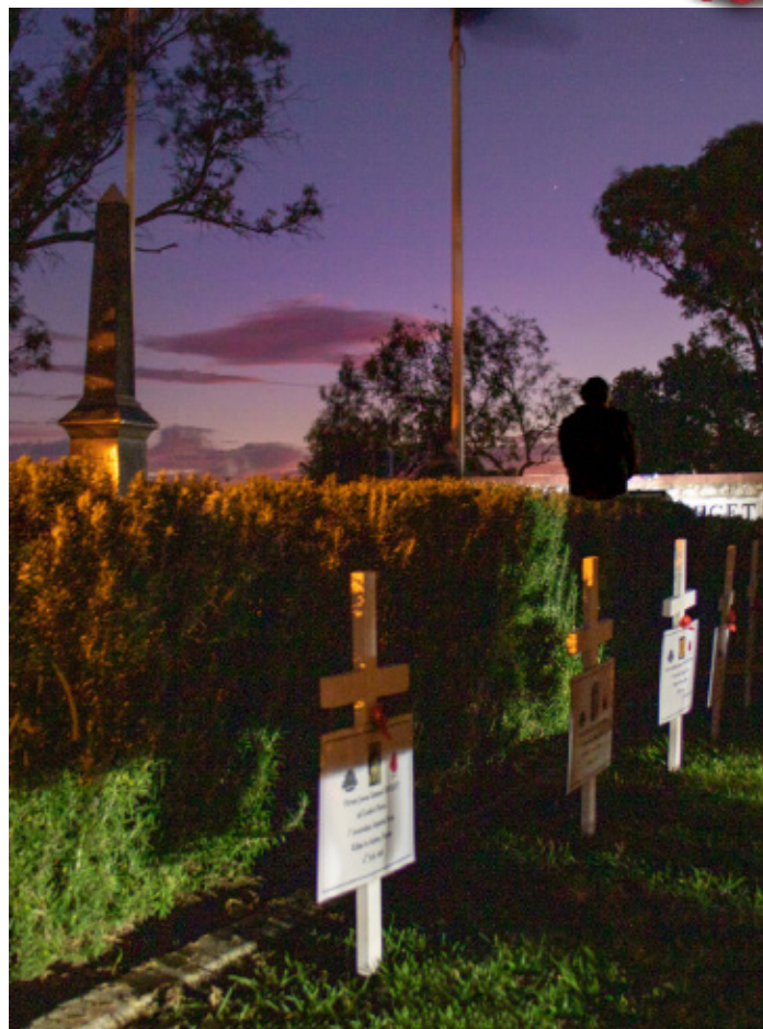
ABOVE: Rows of crosses stand in quiet tribute, honouring those who served and sacrificed.

A warm thank you goes to all volunteers and the Students from Tailem Bend Primary School whose efforts ensured the service ran smoothly. Appreciation is also extended to the generous local businesses who supported the event through raffle donations: