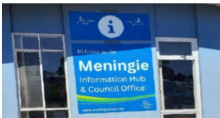
Above: New signage installed at the Meningie Information Hub

The Community Facilities teams have been busy in Tailem Bend removing graffiti on Cosi's Rhino and other public spaces, re-painting the Tailem Bend bus shelter by the Shell Service Station and tidying up fallen trees along the highway median strip. While in Meningie new signage has been installed at the Information Hub, illegal dumping has been collected, and maintenance on the playground and outdoor equipment has kept the team busy.