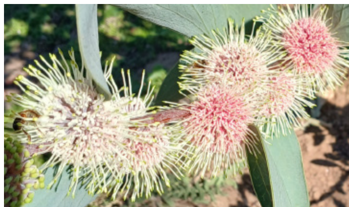
ABOVE: Hakea petiolaris in bloom at Pangarinda, showing its distinctive mauve-pink globular flowers.

It can be seen growing among granite outcrops in the wheatbelt region of Western Australia. With age, it retains its seed capsules on the dead wood.