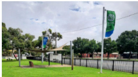
Above: New town specific banners installed at Tintinara.

While in Tintinara has seen new banners installed on the banner poles and tree maintenance and tidy up works undertaken.