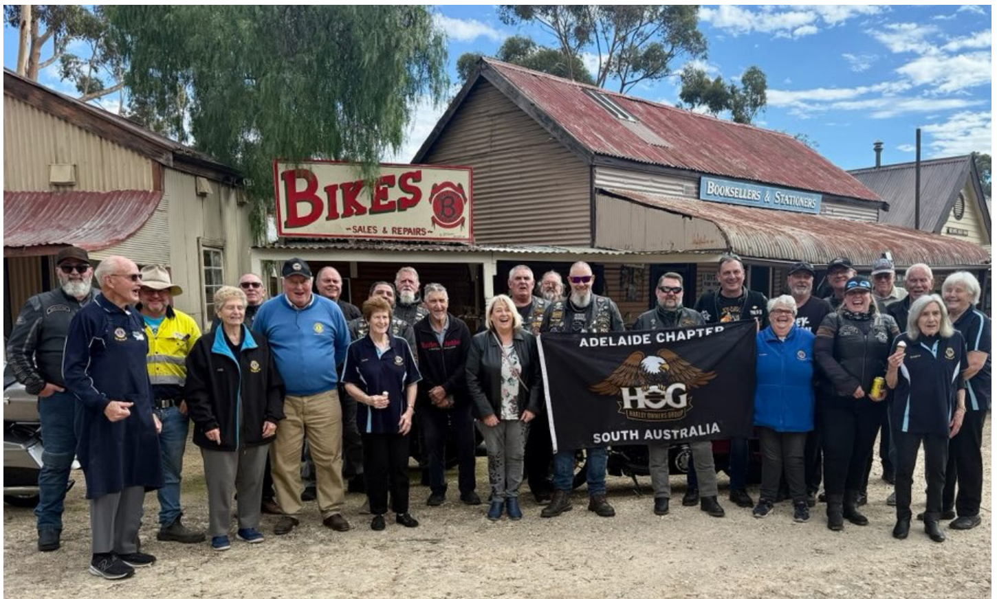
ABOVE: Tailem Bend Lions Club members and HOG riders gather for a group photo at Old Tailem Town, proudly displaying the Adelaide Chapter HOG South Australia sign after a fantastic day of riding and hospitality.