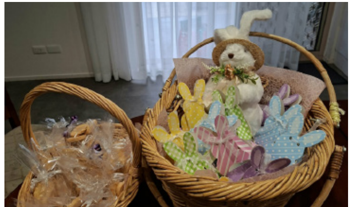
ABOVE: Easter goodies prepared and handed out to bring a little extra joy to residents.