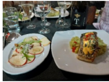
ABOVE: The main meal.