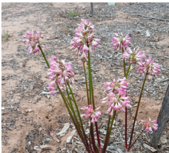
ABOVE: After the first autumn rains, Calostemma purpureum bursts from the soil, its rich wine-red flowers bringing colour and life to Pangarinda Botanic Garden.

Alongside it, another species adds contrast to the garden's seasonal display. Calostemma luteum , with its smaller but equally eye-catching yellow flowers, brings a bright, sunny tone to the autumn palette. Unlike many flowering plants, the flower heads of C. luteum gradually die back and form bulb-like structures. These drop to the ground and self-sow, allowing the plant to naturally regenerate and spread throughout the garden.