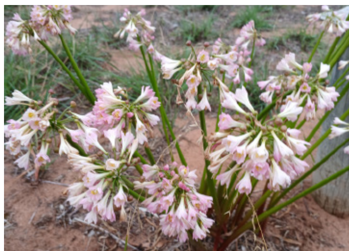
ABOVE: Calostemma purpureum .

Together, these two species create a subtle yet stunning display at Pangarinda Botanic Garden each autumn. Their emergence following rain serves as a gentle reminder of the cycles of nature and the importance of preserving native plant species in our local landscapes.