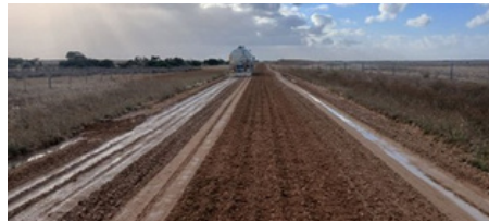
Above: Unsealed road renewal works on Loveday Bay Road, Narrung

Works have commenced on 5km of renewal at Taunta Hut Road which are expected to be completed in mid-April before works shift to Deepwater Road .