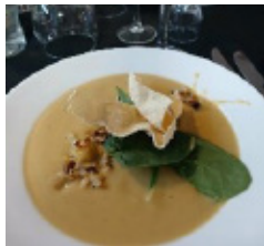
ABOVE: Cauliflower Soup

Cauliflower korma soup was then served, its aromas tantalising the taste buds. It was a beautiful colour, silky smooth, and absolutely delicious. A pappadum placed on top added to the flavour experience. It's certainly a dish I would like to try to replicate at home. A Shaw Family Pinot Grigio was served with this course; some noted the second sip tasted slightly bitter after the soup, though it improved with subsequent sips. I always enjoy a Pinot Grigio or Pinot Gris, and this was no exception.