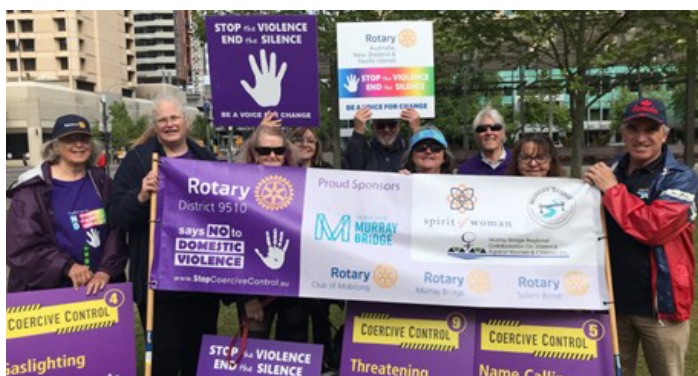
ABOVE: Rotary clubs of Tailem Bend, Mobilong and Murray Bridge attending the Say No To Domestic Violence.