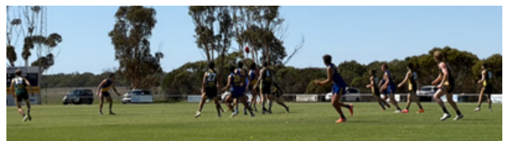
ABOVE: Tailem Bend Eagles in action ahead of the 2026 season, building momentum with eyes on finals.

On March 21, the Eagles Reserves and League teams hosted the Marion Rams Football Club (MFC) at home for a trial match. The Rams built a comfortable lead in both matches, but the A Grade Eagles fought back late in the game with a strong effort. Ultimately, MFC won both matches, giving Tailem an opportunity to reflect ahead of the RMFL season.