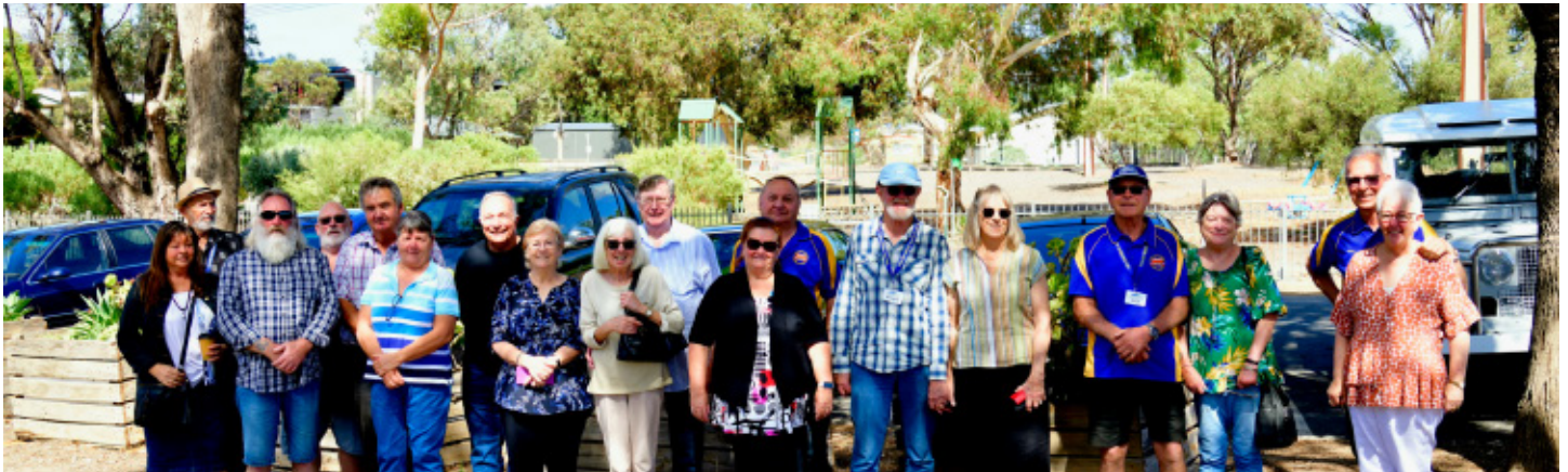
ABOVE: Members gathered at the Bowhill Store, enjoying a coffee break and riverside views before continuing their scenic cruise to Mannum.