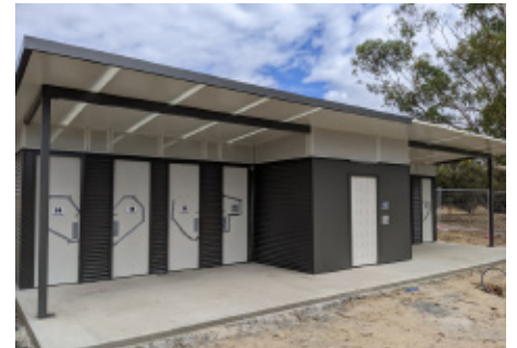
Above: Coonalpyn Changing Places Building under construction.

The prefabricated building was installed in mid-February, and internal works are now underway. Upgrades to the septic system have also been carried out to increase capacity for the larger facility.