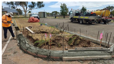
Above: New kerb works at Railway Terrace car park, Taillem Bend.

Temporary fencing went up in late February and works are now underway, with new kerbing and civil works taking place.