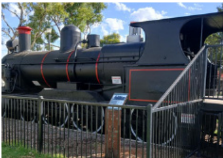
Above: Renewed historical interpretive signage installed at the Taillem Bend Train Park.

The Taillem Bend Train Park's historical interpretive sign has been replaced and the Tintinara and Coonalpyn playgrounds have received a top up of soft fall mulch.