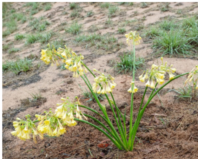
ABOVE: Bright and sunny, Calostemma luteum adds a golden touch to the garden, thriving in drier conditions and naturally regenerating each season.

Native to more inland areas of South Australia, New South Wales, and Victoria, Calostemma luteum is well suited to drier conditions and continues to flourish with minimal intervention.