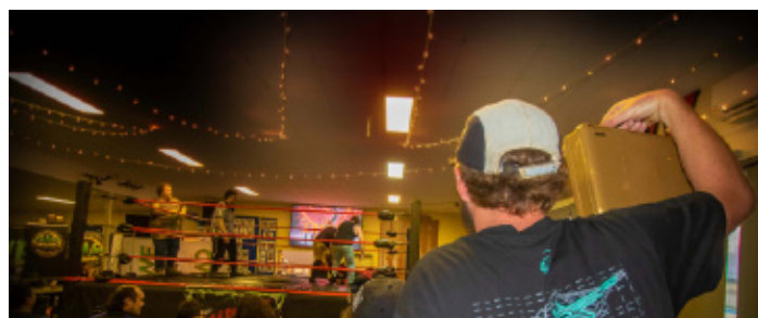
ABOVE: Crowd enthusiasm and participation adding additional entertainment and creating an exciting, electric atmosphere at Tailem Bend Football Club's Championship Wrestling.