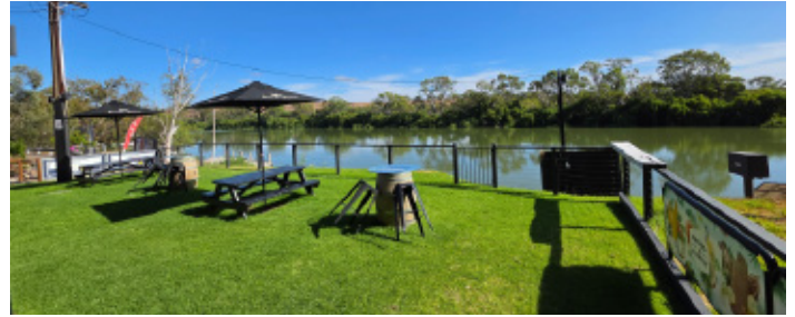
ABOVE: View of the Murray River from the Bowhill store.