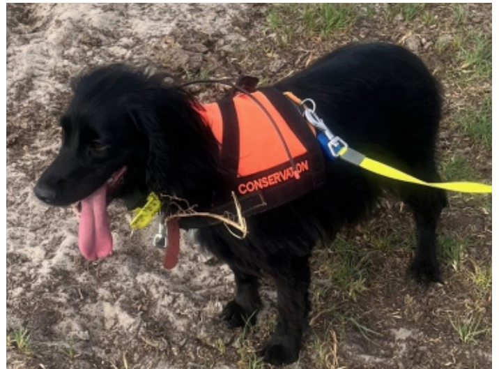
ABOVE: Conservation & Detection Dog Hettie.

The dogs involved in this program are trained to detect specific scents, including those of River Murray Turtle nests, pygmy bluetongue lizards, feral pests such as foxes and cats, and invasive weeds. The use of conservation detection dogs is becoming increasingly popular across Australia. Through trials, research, and fieldwork, conservationists are proving that dogs are not only faster but also more effective at achieving fieldwork goals compared to traditional methods. Mandy Jones of Conservation & Detection Dogs South Australia highlights the importance of partnership in this work.