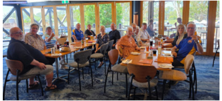
ABOVE: Lunch at the Pretoria Hotel Mannum.