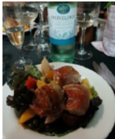
ABOVE: The entrée.

The entrée followed: pork stuffing balls with nectarine salad. A little unusual, but very flavourful. As we often find at the Riverside, the portion size was generous—two would have been enough for me, though I happily finished all three. The meatballs featured flavours of onion, celery, apple, thyme, sage and lemon rind. A Stoneleigh Sauvignon Blanc was served and proved a good accompaniment.