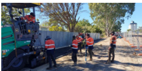
Above: Laying asphalt footpath, Fulwood Avenue to the Tintinara Apex Park

Tintinara's Footpath Expansion Project has seen the installation of a new asphalt path and fencing along the railway corridor from Fulwood Avenue to the corner of the Tintinara Apex Park.