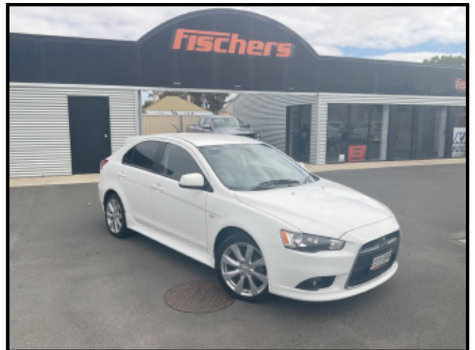
2014 Mitsubishi Lancer $13963