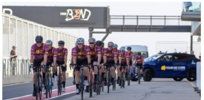
ABOVE: Tour de Cure's Discovery Tour 2025 team, doing a few hot laps before the beginning of their ride to Adelaide via Mannum the following morning, Shell V-Power Motorsport Park Tailem Bend.