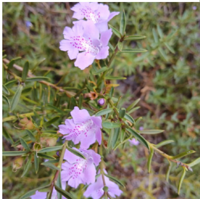
ABOVE: Hemiandra pungens var incana .