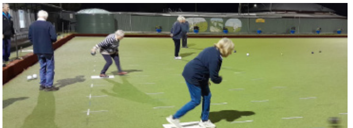
ABOVE: Members enjoying a game of Bowling.

This ensures adequate hand washing facilities are always available to Lions members.