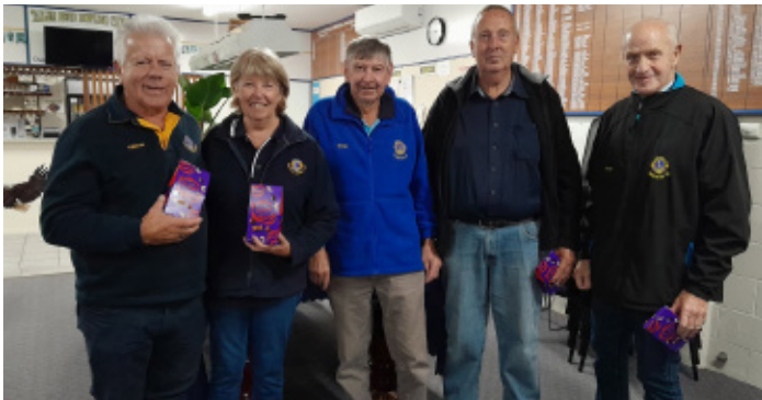
ABOVE: Team prize winners on the night.