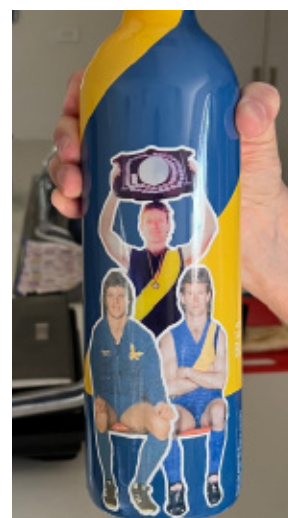
ABOVE: Wine bottle depicting Bret's photo and career details.