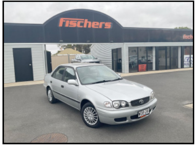
2001 Toyota Corolla $6463