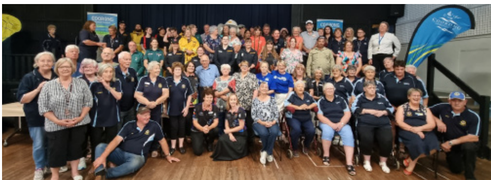
Above: Group photo of all the volunteers from the organisations represented at the Volunteering Expo