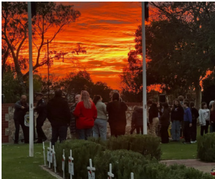
ABOVE: Photo provided by the RSL Tailem Bend.

The wreaths were laid by Tailem Bend RSL, Coorong District Council, Tailem Bend Primary School, Unity College, Tailem Bend Community Centre, Tailem Bend Netball Club, South Australia Police Murray Bridge Tailem Bend Historians, and others in attendance.