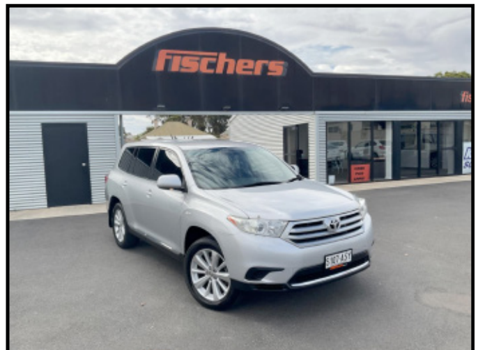
2012 Toyota Kluger $16956