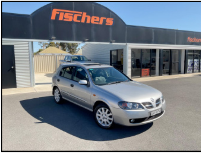
2005 Nissa Pulsar $7956