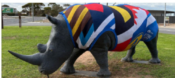
ABOVE: Cosi's Rhino dressed for Gather Round in April!

We look forward to being of assistance soon. Experience the Glow difference!