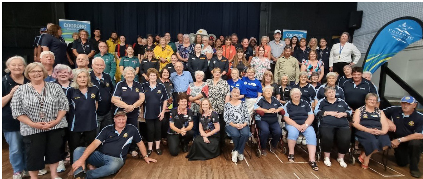
ABOVE: All the participants of the 2025 Volunteer Expo in Tailem Bend.