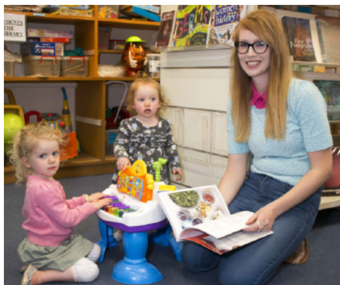
ABOVE: Tailem Bend Library kids books and toys.

Further information is available in the attached media release or at www.coorong.sa.gov.au/community/latest-news