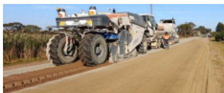
Above: Cement stabilisation on Alexandrina Drive, Narrung.

The remainder of the 2024/25 Sealed Roads Renewal Program is underway with Myrtle Place (Tailem Bend), Alison Court (Wellington East), and Hannah Well Road (Coomandook) receiving new asphalt, and cement stabilisation works are underway on Alexandrina Drive (Narrung), with new asphalt to follow.