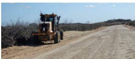
Above: Shoulder Widening Works underway at Carcuma Road Stage 2B

Works on the final section of the Carcuma Road upgrade at Tintinara are underway. Clearing and shoulder widening works from the Southern Cross Road intersection to the Council boundary are in progress.