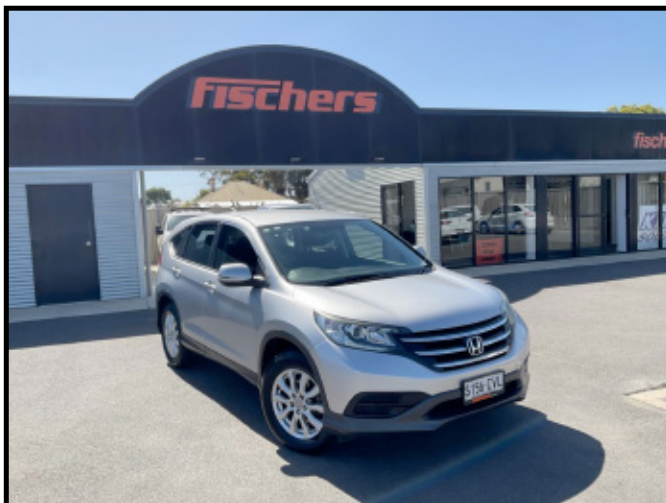
2013 Honda CR-V $15956