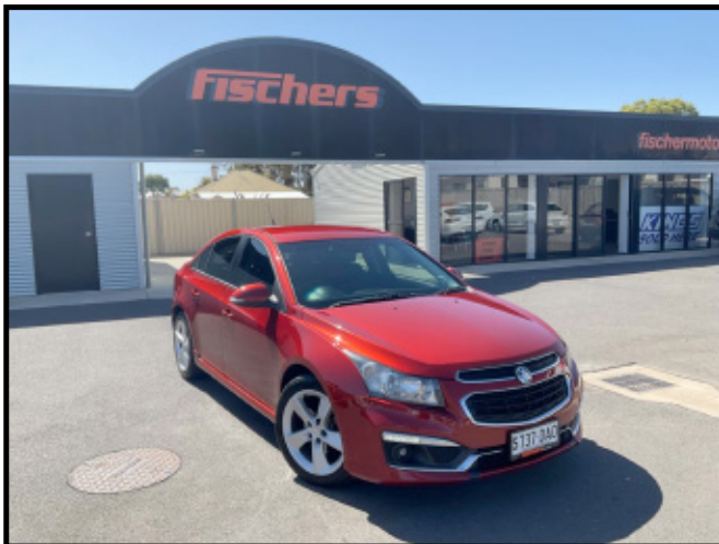
2015 Holden Cruze $13956