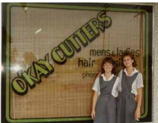
ABOVE: O'Kay Cutters 1985