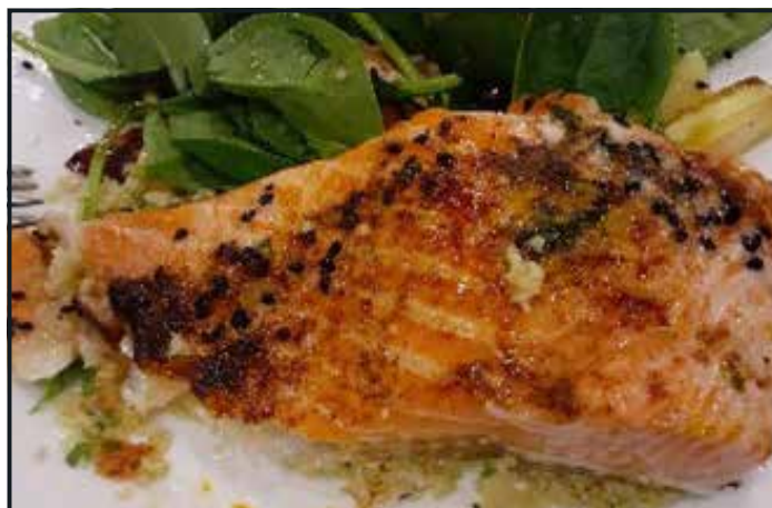
ABOVE: Tailem Bend Food and Wine Club, February 2023.

Enquiries can be made to tbfwclub@gmail.com