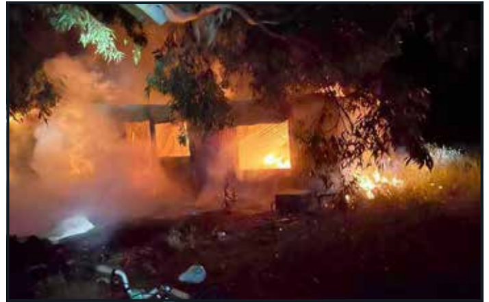
ABOVE: House fire Tailem Bend, 09.01.23.