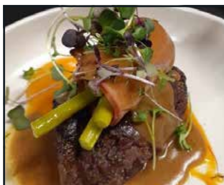
ABOVE: Food and Wine Club, October 2023.