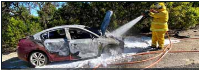
ABOVE: Vehicle fire Elwomple, 2023.