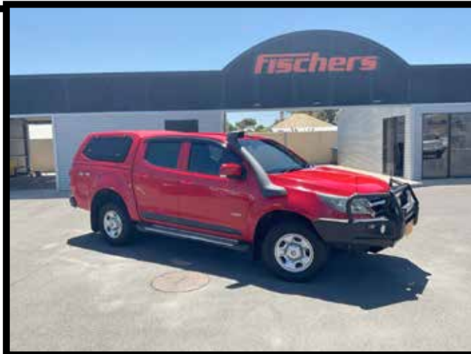
2017 Holden Colorado Crew Cab 6 speed manual 94000 kms $33980