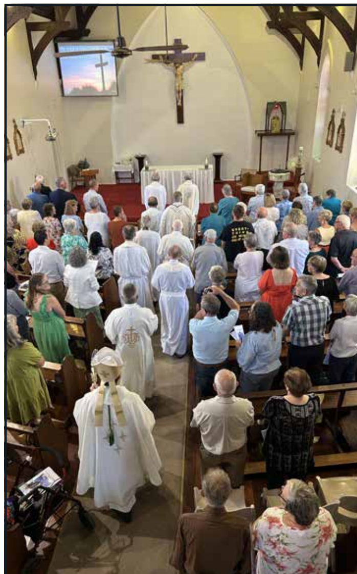
ABOVE: Catholic Church Centenary.

The centenary celebration stood as a testament to the church's enduring presence and the profound impact it has had on the lives of many, highlighting the special role our priests and sisters have played over the past 100 years.