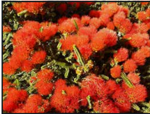
ABOVE: Beaufortia squarrosa in full bloom.

One of the 19 species found in Australia. Grows to a compact bush of 2m. A spectacular plant when in bloom, covered with bright red bottle brush like flowers.