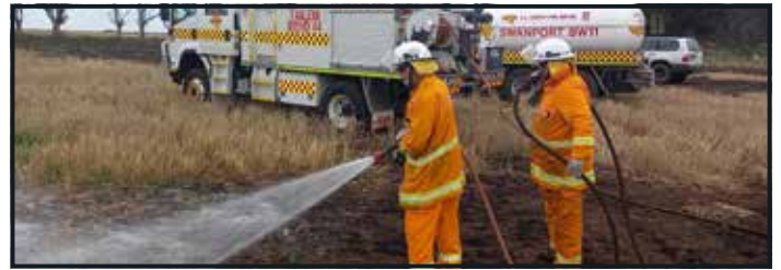
ABOVE: Grassfire Woods Point, 2023.

For more CFS information visit: www.cfs.sa.gov.au/about/about/about-us/