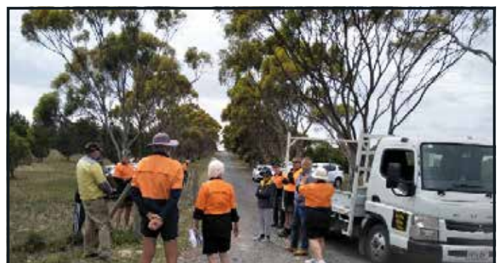
ABOVE: Volunteers at the Tailem Bend Cemetery discussing the new gates to replace the present farm gate.