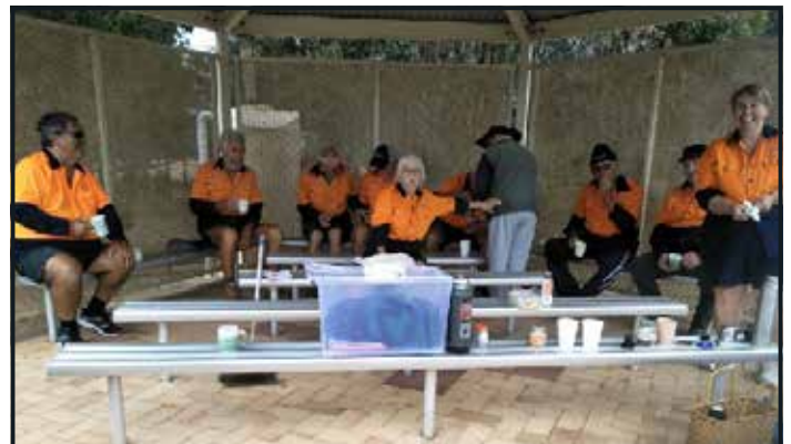
ABOVE: Volunteers having their second smoko break from weeding and general clean up of graves and surrounds.