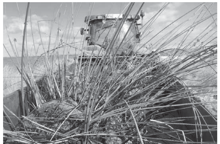
Above: Aquatic River Club Rush translocation underway.