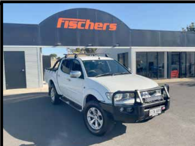
2013 Mitsubishi Triton Dual Cab Utility 18900 kms Auto $19980

2008 Ford Fiesta Hatchback Only 80348 kms