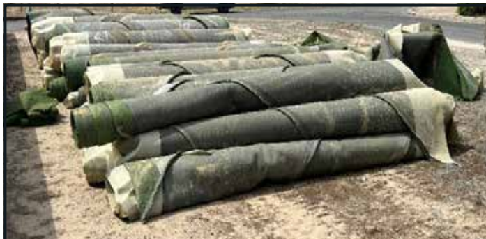
ABOVE: Old turf removed.