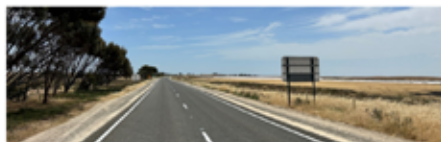
Above: Line Marking Complete, Poltalloch Road.

Poltalloch Road is now complete. Extensive works involved the restabilising of the existing deteriorated pavement, reinforcing two heavy vehicle entrances, sealing and line marking.