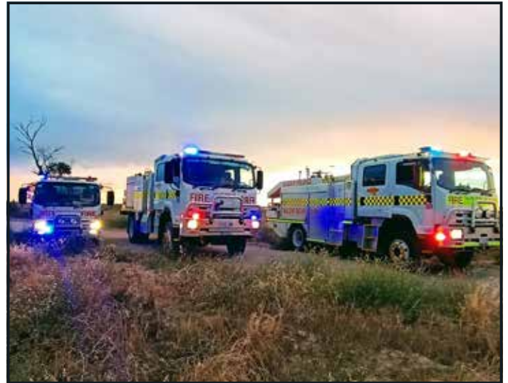
ABOVE: Three Appliances.

On 7/11/23 Our crew attended a site familiarization of the Kanmantoo mine site. This gave our members the opportunity to discuss potential incidents on site and how they can be dealt with.