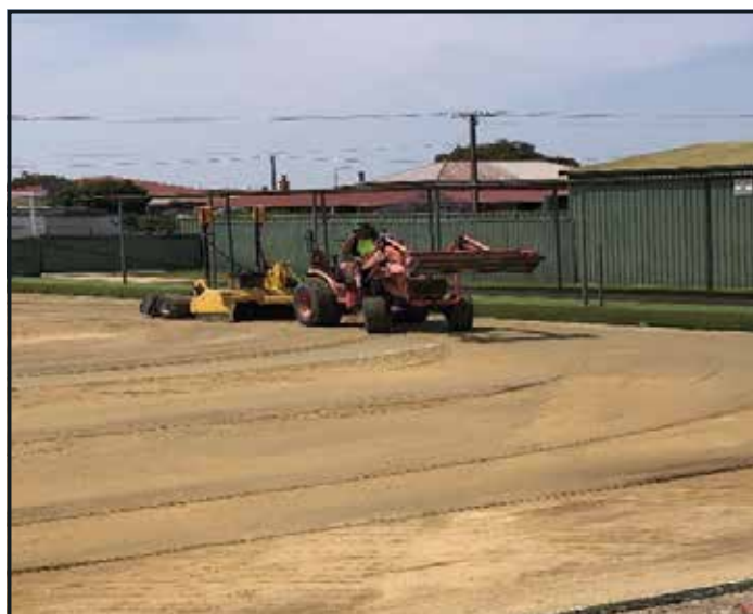
ABOVE: Leveling of the base commences.