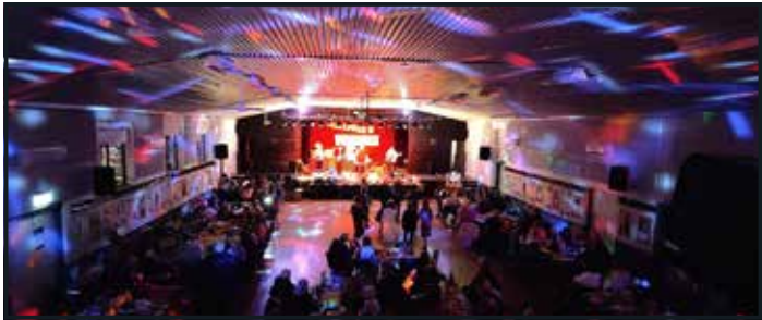
ABOVE: A great night had by all.

We would also like to send out a huge thank you to all who attended and those who supported our cabaret with vouchers, donations, and prizes for our raffle, we could not continue without your valued support. Also, many thanks to the dedicated few who helped to put this show on the road and make this night a huge success.