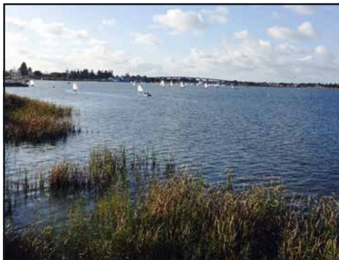
ABOVE: Goolwa Channel. (NW)

For information visit, www.clmmresearchcentre.org or use the QR code to view our survey.