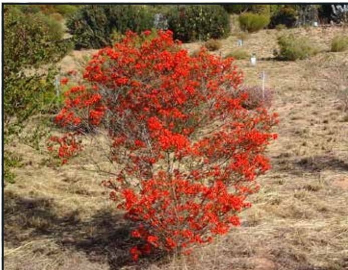
ABOVE: Pileanthus rubronitidus .

Pileanthus rubronitidus grows to a slender shrub of 1m, covered in copper-orange blossom from November until January. Commonly called Copper-cups. Pileanthus peduncularis , a smaller spreading shrub, is also in bloom at present. After the 40+ degree day we had last week it was surprising to see such delicate petals survive. Found growing in the Mid west region of Western Australia.