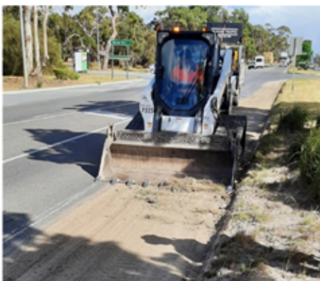
Above: Princes Highway, Tintinara median strip works

Tailem Bend and Tintinara's median strips have received another tidy up with mowing and built up dirt and debris removed from the road edge.