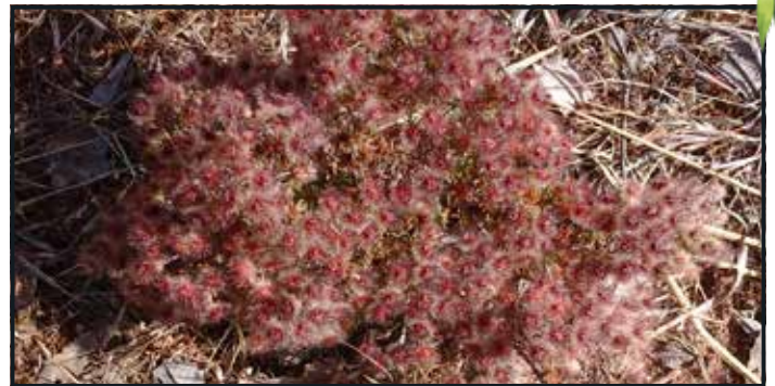
ABOVE: Verticordia humilis .