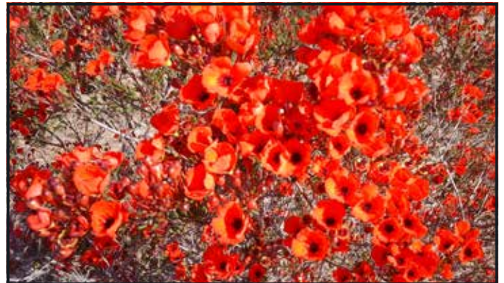
ABOVE: Pileanthus rubronitidus .