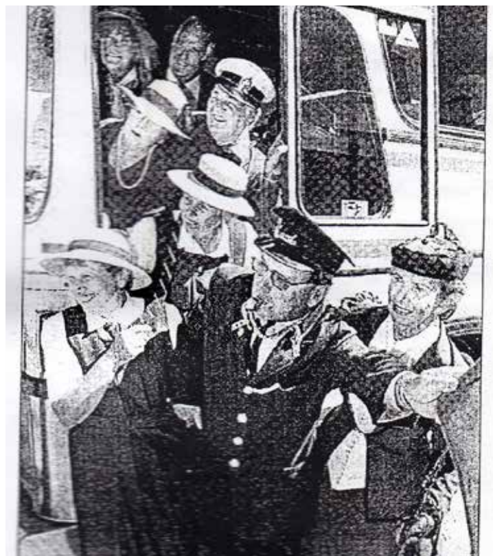
ABOVE: Just the Ticket: Members of the amateur theatre group.