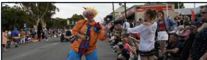
ABOVE: Tailem Bend Christmas Parade

Parents are caregivers please remember during the Parade to keep children behind the blue line as a precaution.