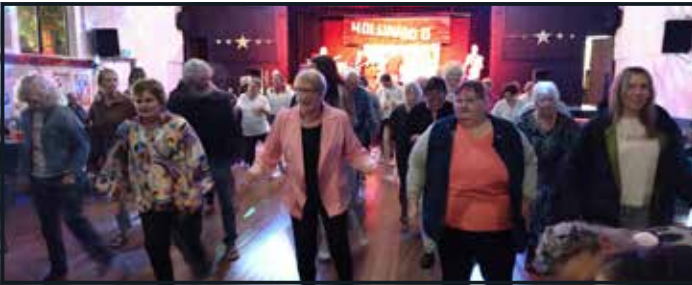
ABOVE: The dance floor is alive and jumping!