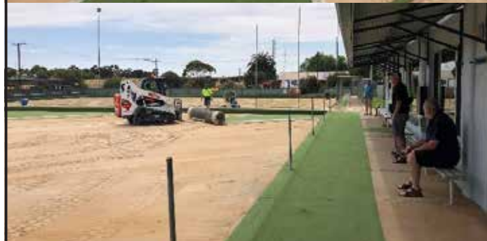
ABOVE: Removal of old turf begins with club members watching on.