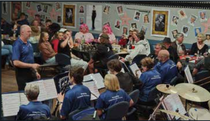
ABOVE: The Murray Bridge Community Band.

The Murray Bridge Community Band and local band Arkive entertained the crowd, with all ages putting on their dancing shoes and taking to the dance floor to swing the night away. Some attending made the effort to dress for the occasion and they looked amazing in their outfit. There were many great prizes won and we would like to thank everyone who purchased a raffle ticket and congratulate all the winners!