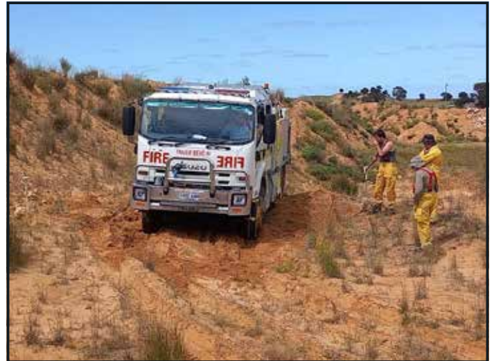
ABOVE: Driver Training.

Scenario 3 was a running grass fire drill working with the other trucks, monitoring water levels, communicating and at the end having to extinguish Haybales.