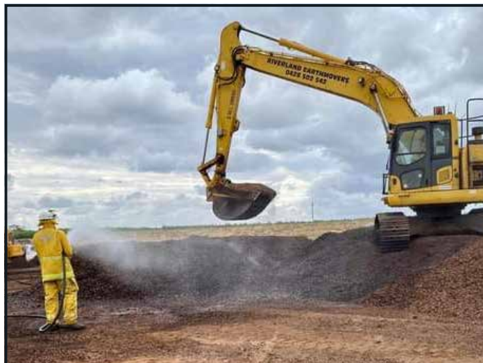
ABOVE: Paringa Almond fire.

On 3rd October one Tailem Bend Truck and crew was deployed to Paringa in the Riverland to assist with a fire that had been burning through piles of almond husks at a processing facility. 3 of our local brigade stayed the night and supported them in the morning and after some truck trouble we returned home.