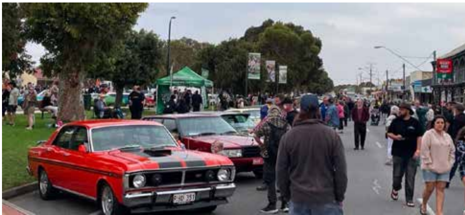
Pictured Above: Vehicle display and crowd at the 2023 Tailem Bend Street Party.

Over 2500 people attended a street party to celebrate the grand opening of the Dragway at the Bend Motorsport Park on Friday, 20 October.