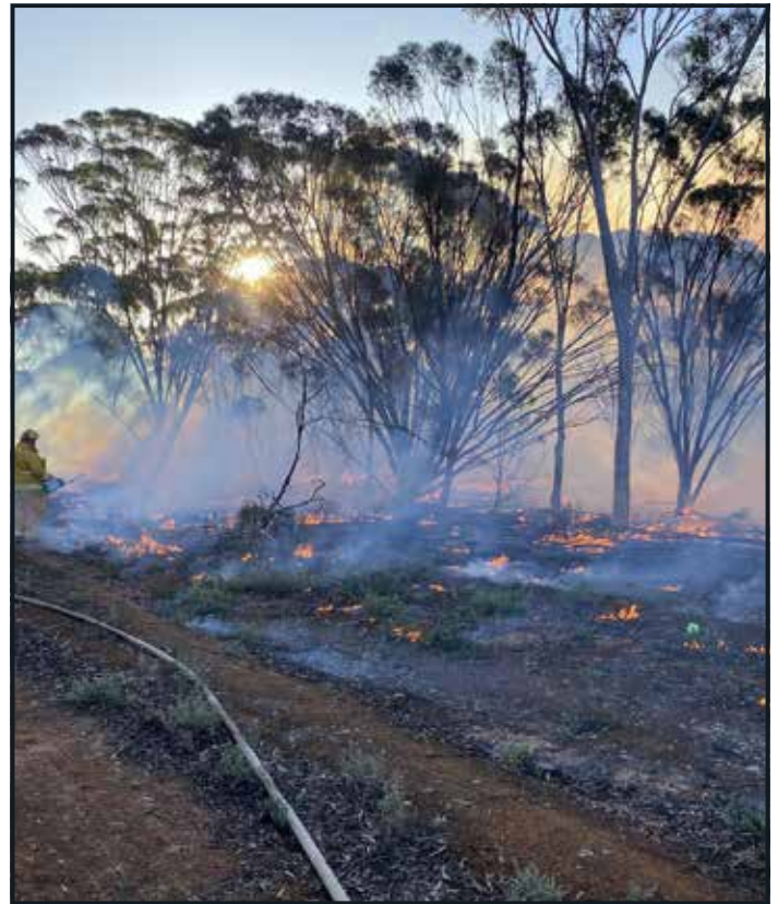
ABOVE: Monarto prescribed burn.