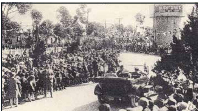
ABOVE: Street Party - Welcomes the Duke and Duchess of York (top)

When Wally came to Tailem Bend, there were only five railway cottages in the place - two of them occupied by the station master and the porter. Dates are not only things Wally can remember.