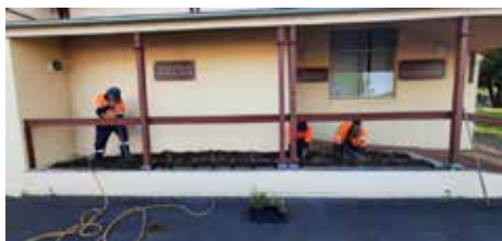
Pictured Above: The Community Facilities team giving the Taillem Bend Function Centre Garden bed a makeover

Improvements to the Taillem Bend Function Centre's garden bed were completed with the planting of native grasses.