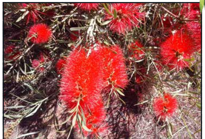
ABOVE: The flowers of Callistemon phoeniceus .

With grey green foliage and rich red flower spikes, varying from an erect to a more open plant, it is proving very easy to grow with very little attention.