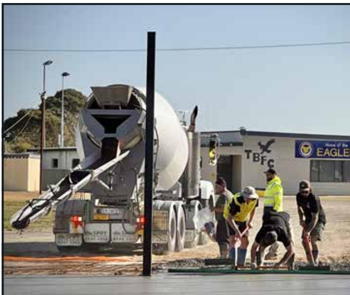
ABOVE: The local team from Sprycrete and Drendals Concreting, both of Murray Bridge, putting the finishing touches on the surface of the Tailem Bend Cricket Club's new training facility.