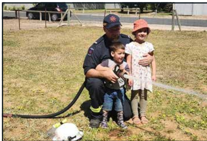
ABOVE: Kindy Visit.

On 28th September we attended a visit with the local kindergarten. Our members gave a talk about the fire trucks and equipment we use. Children were given the opportunity to climb in the trucks and squirt water using fire hoses, which they obviously loved.