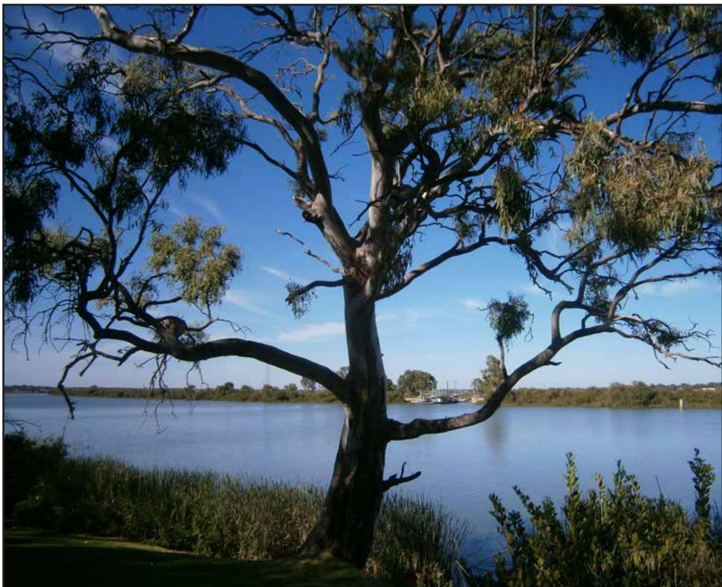
ABOVE: Tailem Bend River 2021.