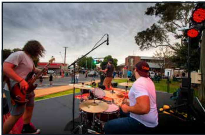
ABOVE: The crowds were buzzing and rocking at Tailem Bend's Dragway Street Party.