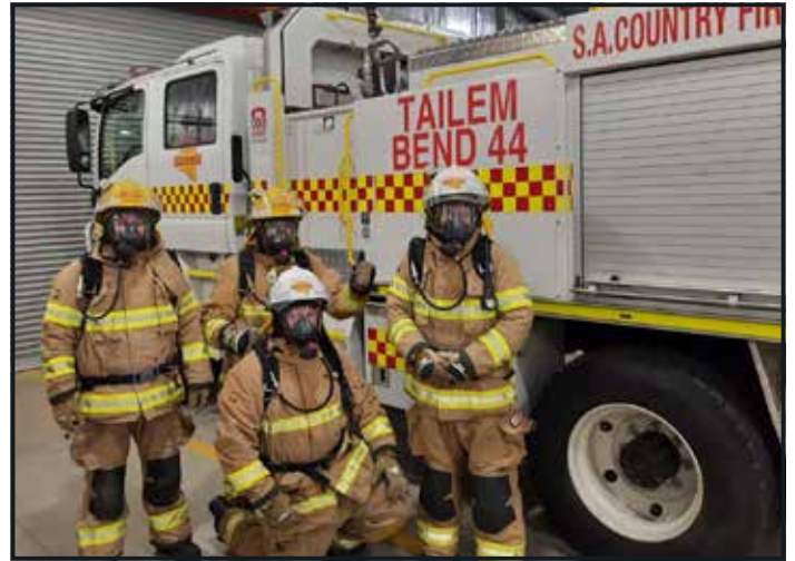
ABOVE: BA Operators.