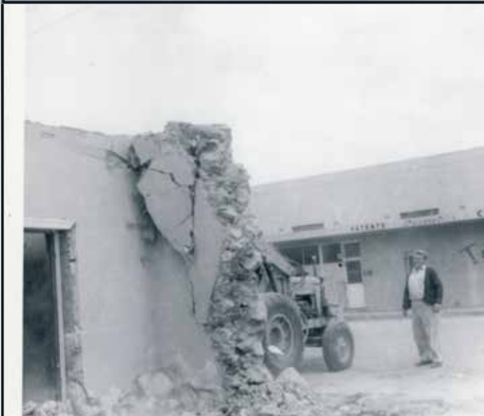
ABOVE: Pictures show the Railway Terrace Building being demolished.