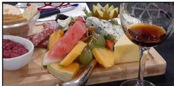
ABOVE: Charcuterie Board.