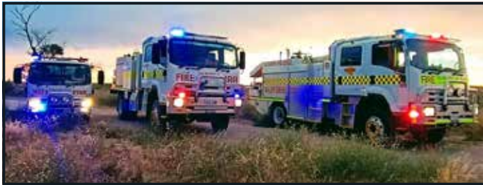
ABOVE: Three appliances.

As a volunteer firefighter you will help provide a vital service to your community. We respond to a range of calls including Bush and grass fire, Building and vehicle fires, Road crash rescue, storm damage and any other incidents that may pose a risk to our community.