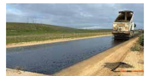
Above: Sealed being laid on Poltalloch Road