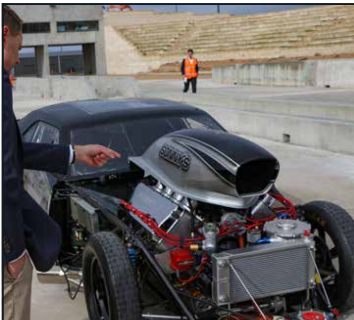
ABOVE: Dragway at The Bend.

The opening round of the Top Fuel championship joins several International and national events on The Bend's 2023 calendar. The positioning of The Bend as one of the premier sports and entertainment precincts continues to attract significant events that drive tourism and employment in the region. World-renowned brands such as Michelin, Ferrari, Porsche and Lamborghini will host international events at the venue alongside Australia's top-flight two- and four-wheel motorsport categories in the Supercars Championship and the Australian Superbikes.