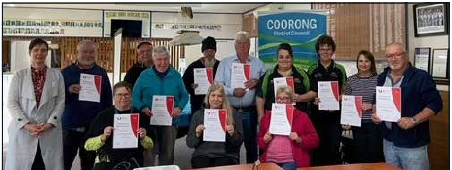
ABOVE: Participants from Taillem Bend session of succession planning & governance.

Many hands make light work, if there is one small way that you can contribute then please consider putting your hand up.