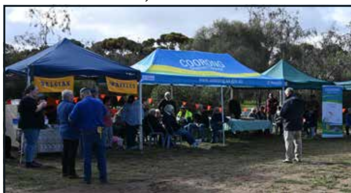
ABOVE: Visitors were treated to hourly guided walks of the garden, and the BBQ lunch was provided by the Meningie Lions Club.