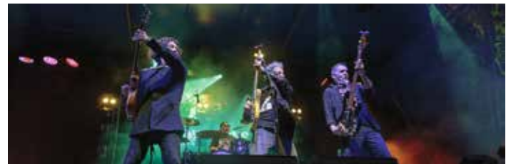
ABOVE: Heritage Bank Concert, Choirboys.