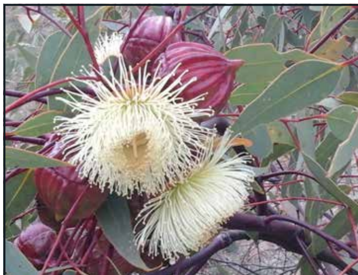
ABOVE: The yellow flowers of Eucalyptus youngiana.