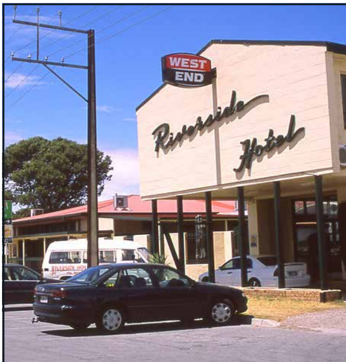
ABOVE: Riverside Hotel, Tailem Bend.

The particular scene at the Riverside Hotel saw the band rejected by the racist hotel manager.