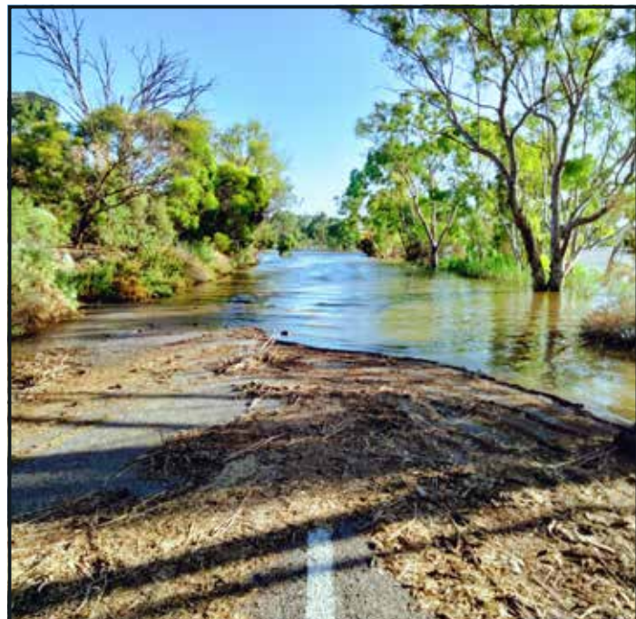
ABOVE: Thiele Reserve, Siesta Dr.