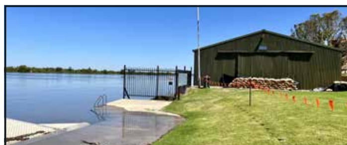
ABOVE: Dickson Reserve.