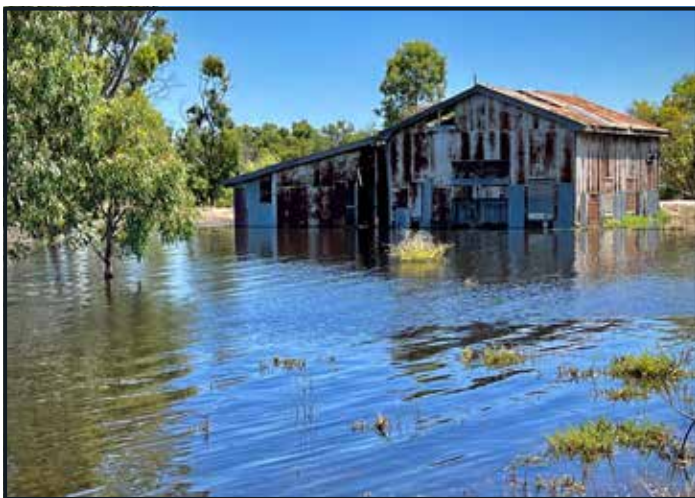
ABOVE: Swanport Village, Murray Bridge.