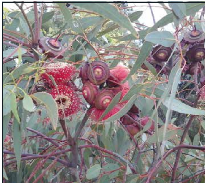
ABOVE: The red flowers of Eucalyptus youngiana.

These plants can become straggly with age but will respond well to pruning.