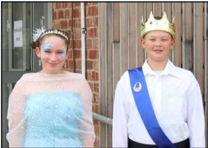
ABOVE: Our Prince and Princess!

Thank you to everyone who attended, our Sponsors and everyone who helped create such an awesome night! And a special thank you to those that put lights on their houses! It all added to the atmosphere.