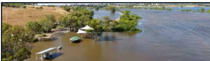
ABOVE: Thiele Reserve, Murray Bridge.