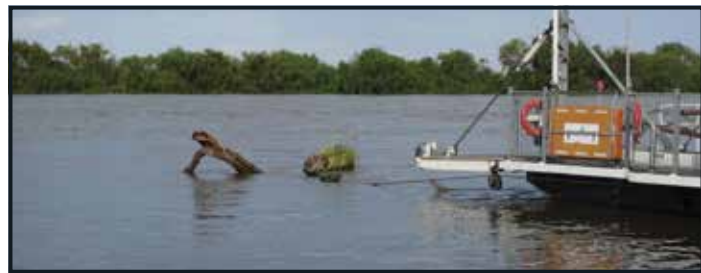
ABOVE: A tree stuck on the Wellington ferry cables.