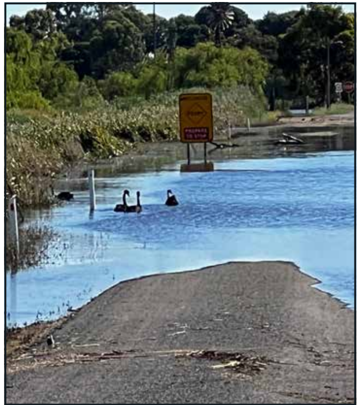
ABOVE: The water on the ferry road.