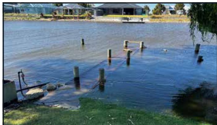
ABOVE: Wellington East Marina, water is at its peak!