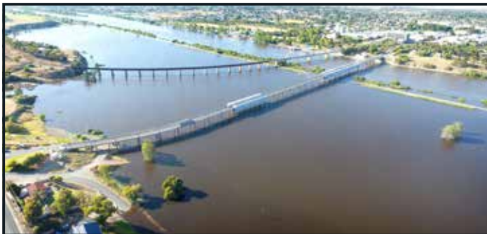
ABOVE: Looking south over the bridges, Murray Bridge.