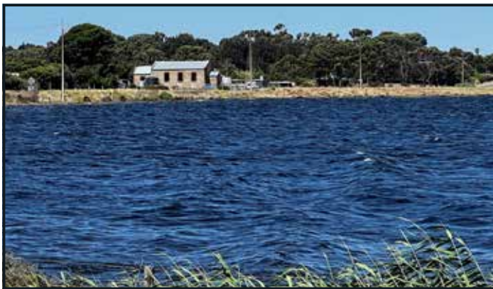
ABOVE: Wellington East marina.