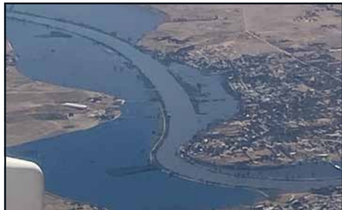
ABOVE: Overlooking the River Murray in a plane.