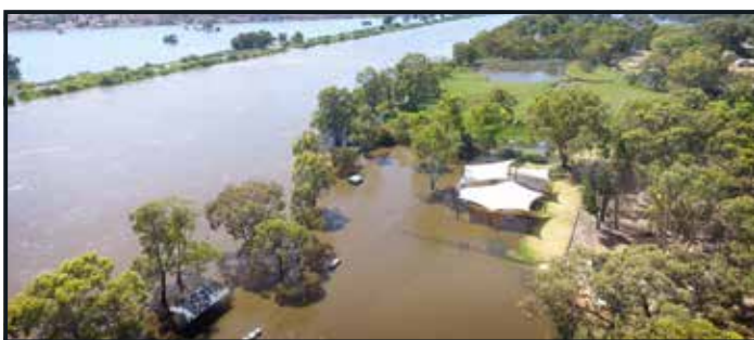
ABOVE: Woodlane Reserve, Mypolonga.