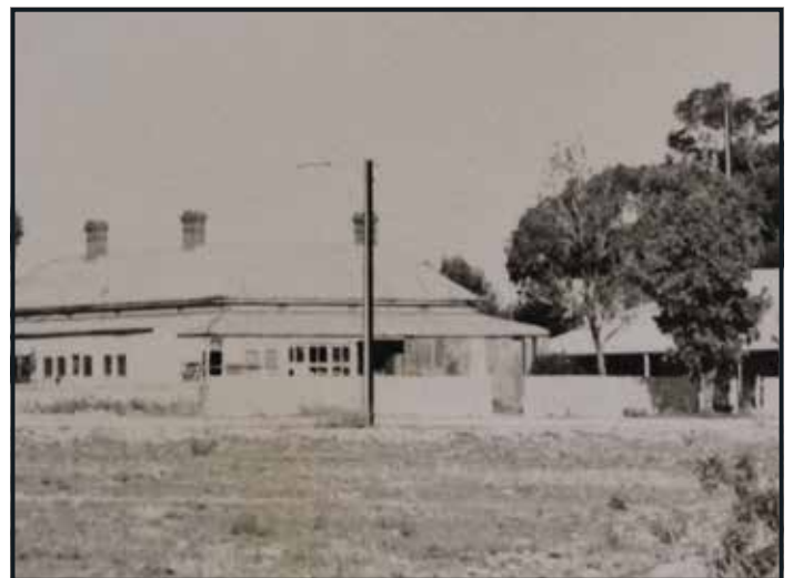
ABOVE: The old Tailem Bend Hospital and Nurses quarters.