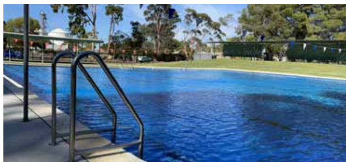
Coonalpyn Swimming Pool Peake Terrace, Coonalpyn

Enjoy the recently renovated pool facilities, including the 25 metre lap pool, wading pool, and canteen operated by our wonderful volunteers.