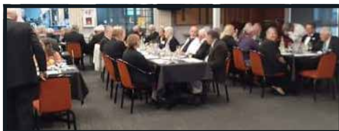
ABOVE: Members enjoying a fabulous dinner held at the Murray Bridge Golf Club.

Diners were then offered a choice of Red Velvet Baileys or Grant Burge Tawny Port. Tea and Coffee was also available.