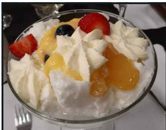
ABOVE: Deconstructed Pavlova.