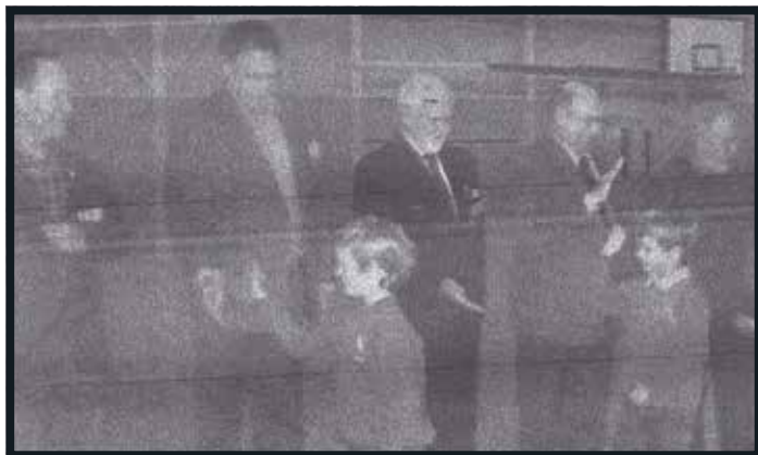
ABOVE: War Veterans visits Tailem Students - Every year war veterans and Tailem Bend Primary School students gather to hold an Anzac Day service. This year veterans visited the school and talked to students about Anzac Day and it's significance and answered questions from the students.

The war memorial was erected in the 1950's when the Prince's Highway was a narrow two-lane road with moderate traffic. Members made the point that in 2004 the site became a four-lane highway which isolated the memorial making it dangerous for people to cross the highway to attend the services.