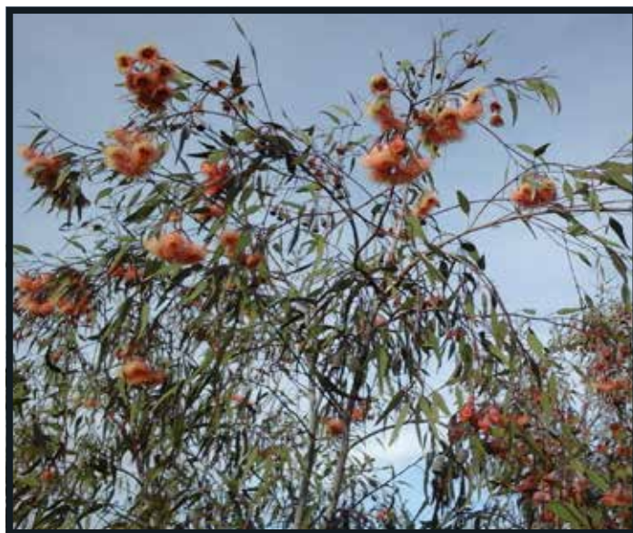
Above: Eucalyptus caesia a favourite resting tree.

Next working bee at Pangarinda it seemed so quiet no Rainbow Birds. The following week for a few hours in the afternoon we had the chittering back, we were visited by a number of Rainbow Birds feeding young also from around the Eucalyptus platypus. Then as quick as they came, they were gone. Perhaps a colony from further south calling in to feed on the way north.