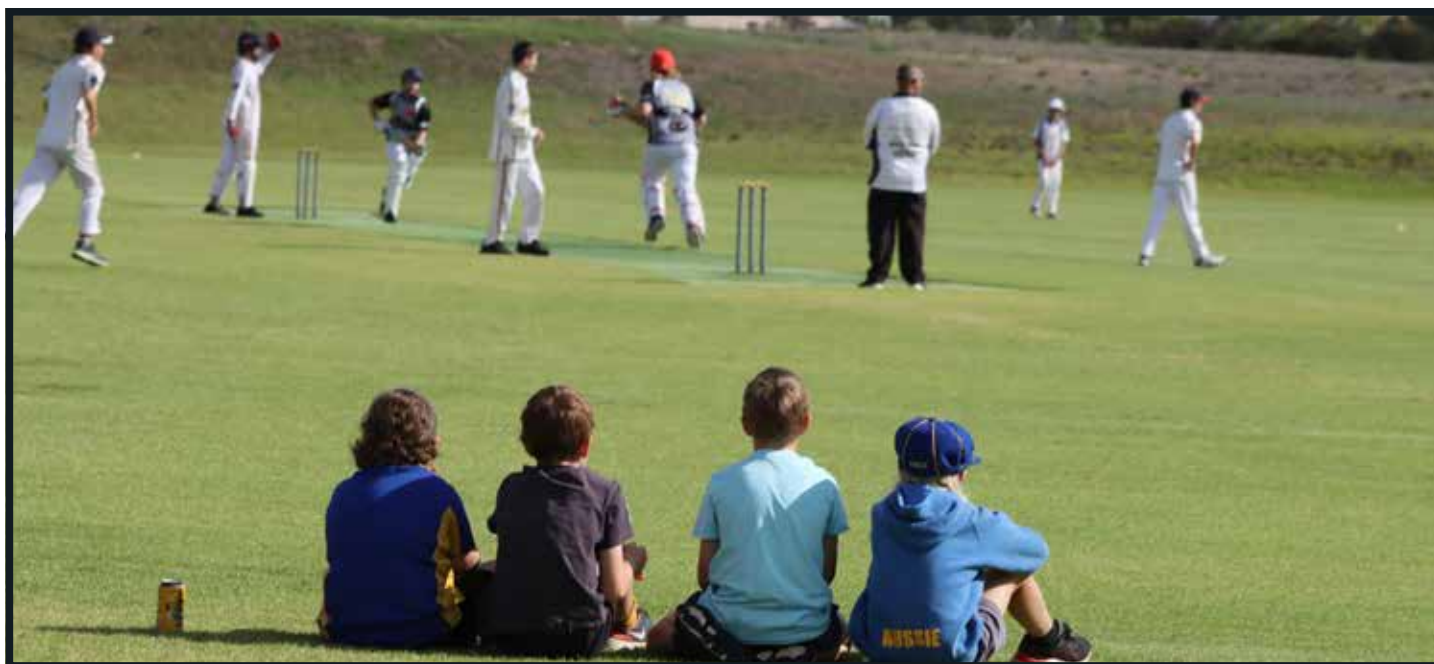
ABOVE: TBCC U 15's V MONARTO - Tailem Bend 8/136 defeated Monarto 8/85.