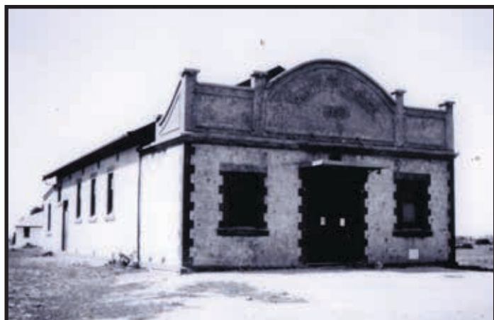
ABOVE: Jervois hall.