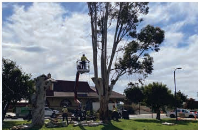
Above: Tree trimming being undertaken on Railway Terrace, Tailem Bend.

Works have already commenced in Tailem Bend and will continue across the district in Meningie (late October - early November), and Tintinara (late November).