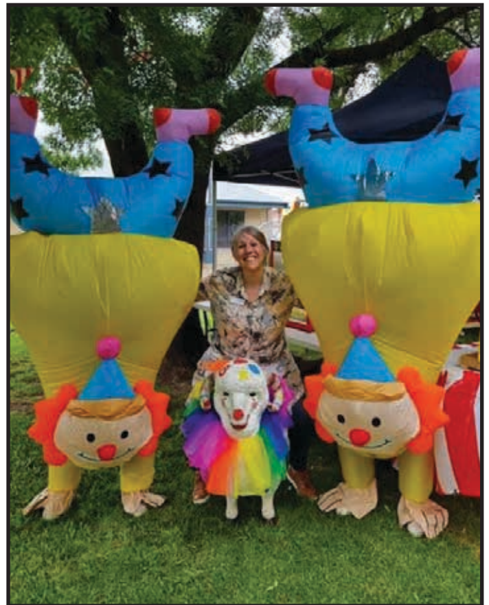
ABOVE: Ageing Expo 2021.

We encouraged consumers to talk about their favorite childhood memories, and reminisce of happy times. Here are some of our favorites. ‘Being with my dad on a one to one in the truck taking wool bales to the wool store in Adelaide’, ‘being all together’, ‘crawling up the wooden stairways in the tower of the Sydney Botanical gardens as my Grandfather was the Curator’.