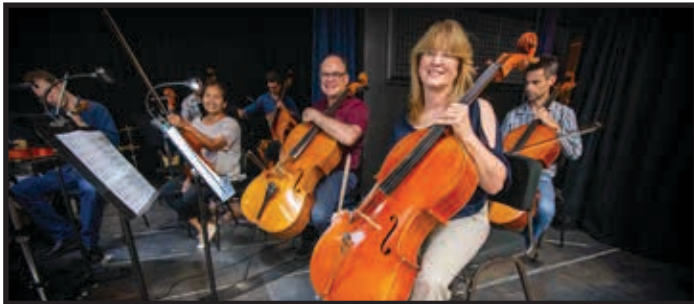
ABOVE: 2021 Adelaide Symphony Orchestra performs at the Tailem Bend Hall.

Students from Tailem Bend Primary School were the first to experience the soft melodic sound of the string and percussion instruments. One lucky student had the opportunity to perform alongside the Orchestra, displaying his newly mastered skills on the violin. This performance had the students dancing in their seats and tapping away to classical pieces, dating back to the Baroque era – 16th Century.