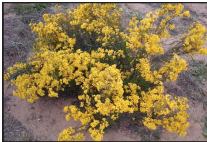
ABOVE: Verticordia chrysanthella flowering at Pangarinda Botanic Garden.

With around 100 species with very few found outside of Western Australia, with a lot of their natural habit disappearing, it is important that we try to keep these plants growing in Gardens like Pangarinda.