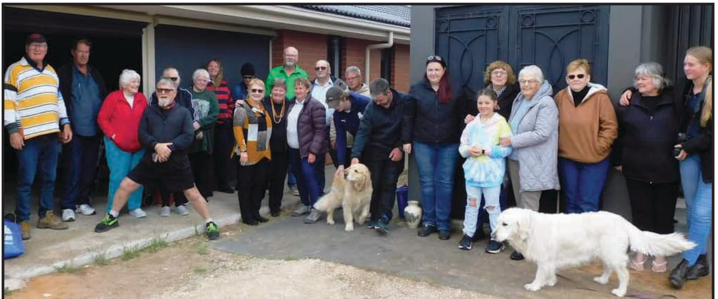
ABOVE: Preece Family Reunion.

Genealogy is important to all families, don't think about it, do it, before it is too late.