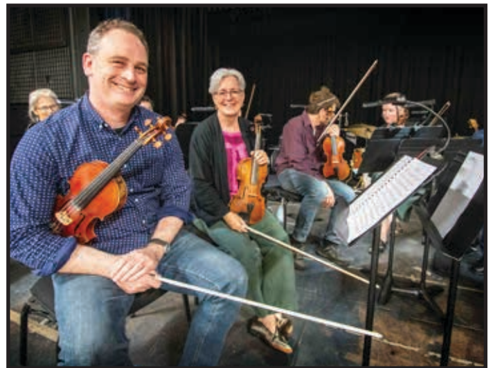
ABOVE: 2021 Adelaide Symphony Orchestra performs at the Tailem Bend Hall.

The final concert for the day was attended by members from the local community and surrounds. With seats quickly filling, the concert was under way with its opening piece of 'Passacaglia in G minor', exposing listeners to a beautiful classical sound.