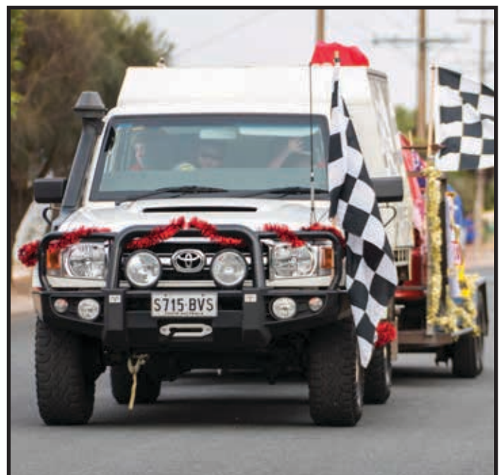
ABOVE: 2020 Christmas Parade.